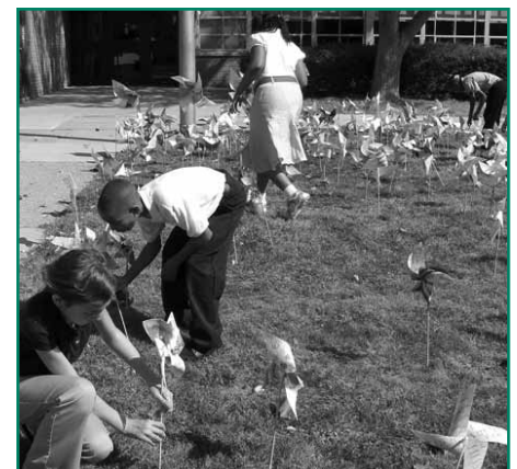
Carylwood students displayed their pinwheels on the school front lawn to promote "whirled" peace.

Pinwheels for Peace was started in 2005 by two Florida high school art teachers as a way for students to express their feelings about what's going on in the world and in their lives. Since then, Pinwheels for Peace has grown from 500,000 pinwheels the first year, to three million pinwheels in 2009! Pinwheels spinning in the wind are intended to spread thoughts and feelings about peace throughout the country and the world.