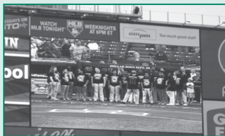
The Madrigal Singers appear on the scoreboard.

. . . Three Bedford High School students enrolled in the Building & Property Maintenance Career/Technology Education Program at Maple Heights High were among the volunteers to build a home in a week for a Maple Heights family as part of the ABC network's "Extreme Makeover: Home Edition!" television show. The episode is set to air in early December 2010.