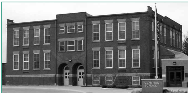
The Ohio Department of Education has named Central School a School of Promise.

rating on the 2009-2010 State Report Card, earning all three possible standards. These standards took into account 3rd grade reading and math scores on the Ohio Achievement Test, plus the school-wide standard for attendance. The school has approximately 550 students in grades kindergarten through three.