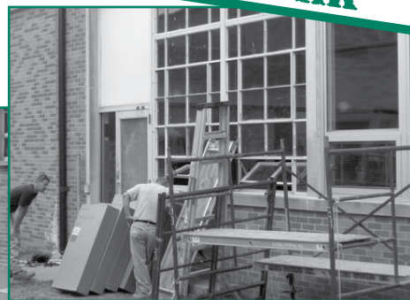
Among the projects undertaken this summer at Bedford High School were upgrades to the gymnasium entrance and installation of new cafeteria windows.